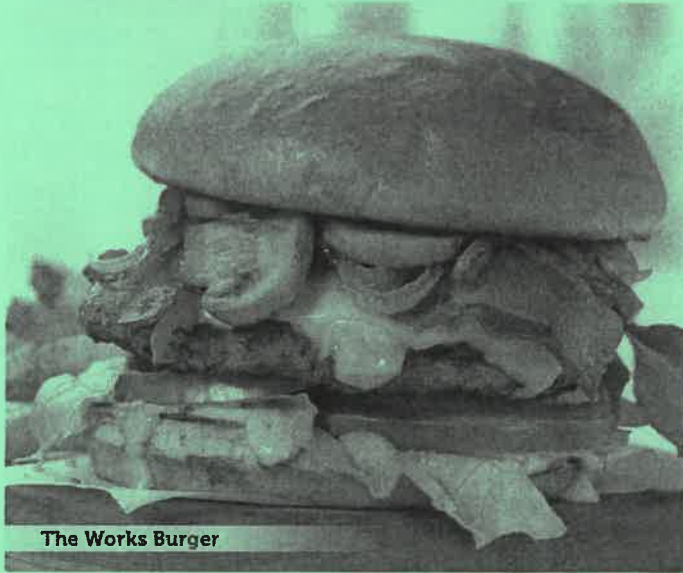
The Works Burger

To benefit the organization listed below, please present this flyer to the cashier at time of purchase.