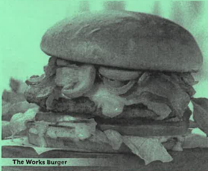
The Works Burger

To benefit the organization listed below, please present this flyer to the cashier at time of purchase.