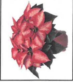
Premium Ice Crystal Poinsettia