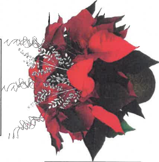
Holiday Dazzler Poinsettias Our 8" poinsettias all dressed up for the holidays! Decorated with glittering berries, jeweled leaves, curly glittering tinsel, organza, and in a glittering snowflake pot. Available in Red or White. $35.00

All of our poinsettias will be dressed in a glittering pot with a snowflake pattern. This sturdy pot is waterproof and will be accented with organza. All plants will also come with a care tag and a protective paper sleeve for shipping.