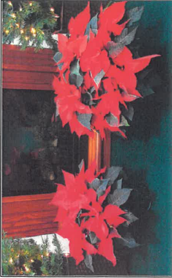
6.5" Poinsettia 5-7 blooms $15.00